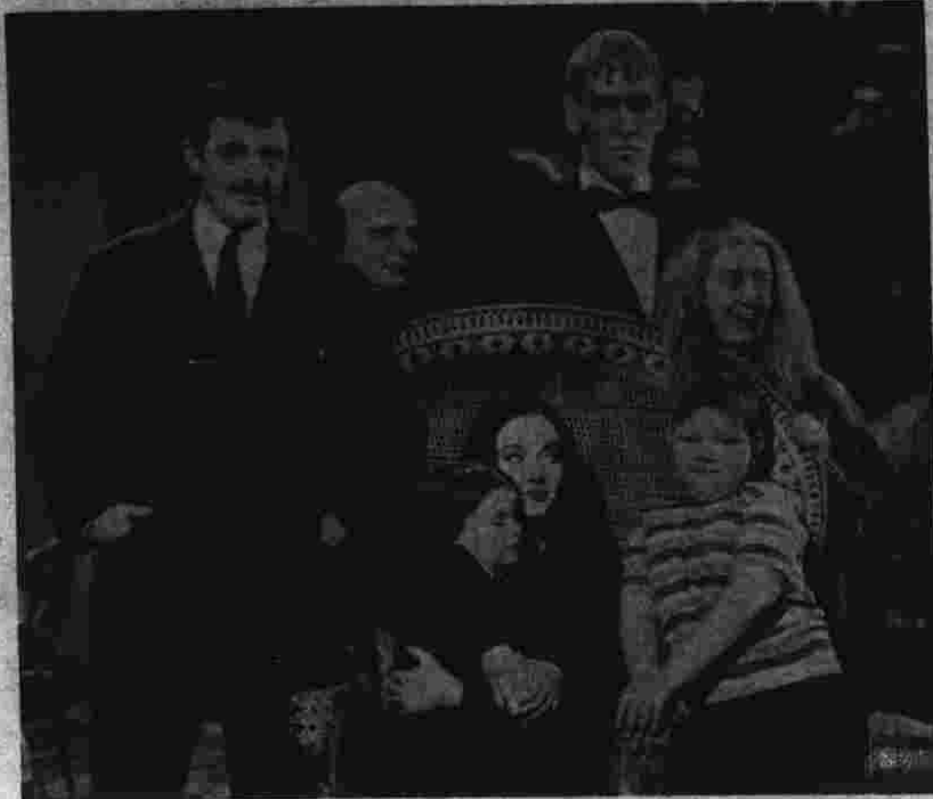
'The Addams Family,' a sort of 'Monster Knows Best.'

CBS has a dozen new shows, seven of which are comedies. "Living Doll" presents the droll idea that Julia Newmar is a robot. "Many Happy Returns" stars John McGiver as the head of a department store's complaint department. Cara Williams is back as a working wife. "Baileys of Balboa," with Paul