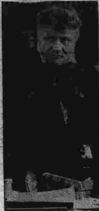
'Profiles in Courage' and Brian Keith

— Marks the entry of big-name motion picture stars into weekly series. People like Charles Boyer, David Niven (NBC's "The Rogues"), Bing Crosby (ABC's "The Bing Crosby Show"), Mickey Rooney (ABC's "Mickey") and Carolyn Jones (ABC's "The Addams Family").